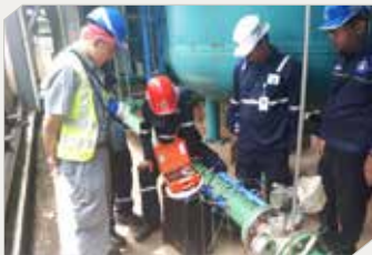
Field Installation Photo