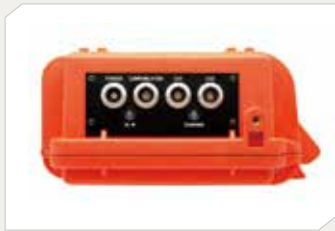
Rugged Waterproof Case