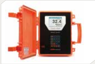
Portable Xonic 100P